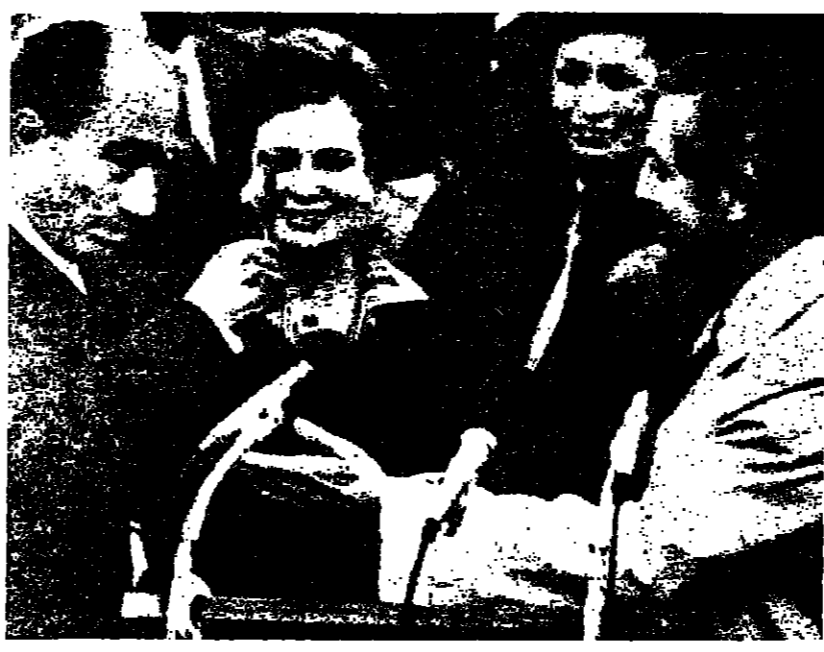
U.S. Vice-President Walter Mondale offers the microphone to President Anwar Sadat to make his arrival remarks at Andrews Air Force Base on Saturday. In the center is Mrs. Jehan Sadat.

BANGKOK (AP). — Vietnam accused China yesterday of launching fresh artillery attacks on Vietnamese territory and occupying 12 new positions, some "well inside Vietnam." A Vietnam news agency broadcast, quoting an article in the Communist Party newspaper "Nhan Dan," said "Chinese troops have in recent days occupied many more areas of Vietnamese territory." "Now they are holding more than 30 positions and areas as against an earlier total of 18, some of these lying well inside Vietnam," the broadcast mentioned in Bangkok said. The article repeated Vietnamese charges that China continues to concentrate troops on the Chinese side of the border and they are building fortifications along the border. The article said China must "bear full responsibility" if peace negotiations cannot start in Hanoi on Thursday. Vietnam's foreign ministry called last Wednesday for negotiations to begin in Hanoi this Thursday after China withdraws all forces behind the historical border between the two countries.